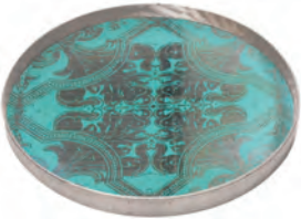
Moroccan Tile Item #:TL-MT-AM Light Aged Mirror