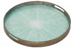
Blue Slice Item #:TS-GS-DW Glass