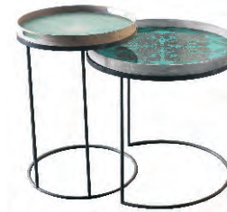
Small Item #:RTTS-19 Size: 19" x 19" x 26"