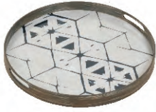
Tribal Hex Item #:TS-THX-DW Glass