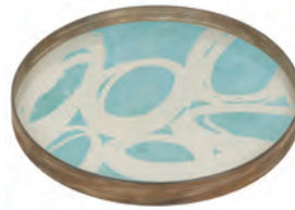
Blue Pebbles Item #:TL-BP-DW Glass