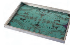
Moroccan Tile Item #:TRS-MT-AM Size: 14" x 18" Light Aged Mirror