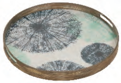
Umbrellas Item #:TS-UM-DW Glass