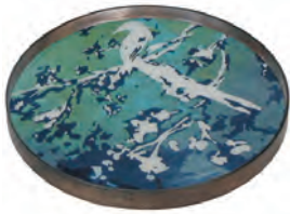
Birds of Paradise Item #:TL-BOP-ST Glass